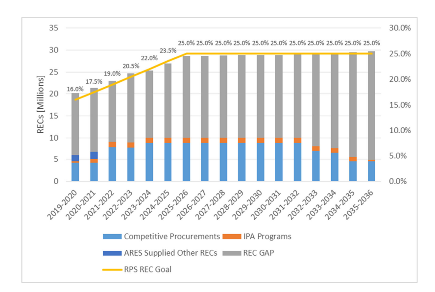
Figure 3-1: Statewide Annual RPS Goal, REC Portfolio and REC Gap